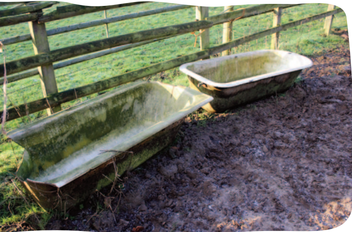
Abandoned bathtubs