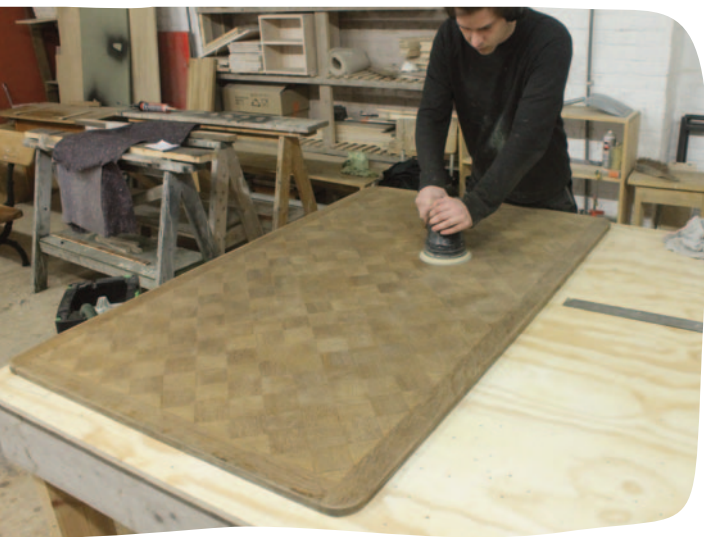
Recup Design Workshop, sanding wooden surface

Household products can also be used to rid surfaces of unwanted marks. Either mixed with water to form a paste, diluted in water to soak an object, or used as an odor absorber, baking soda, or bicarbonate of soda is considered a non-abrasive (very mildly abrasive if kept in powder form) all purpose cleaner. This easy to find product can help get rid of unwanted marks, odours and grease on plastics, carpet tiles, fabric, kitchen appliances, and even your teeth. These are exemplary hygienic reasons to further clean material surfaces.