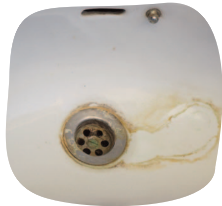
Lime build up on reclaimed sink