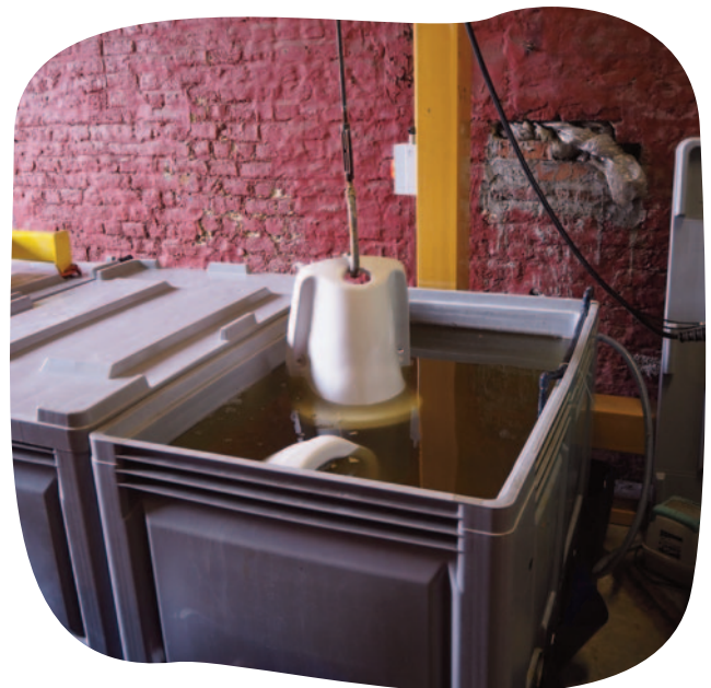
Urinals soaked in acid bath for a deep clean

close the loop. For now, there are tons of resellers who have at least a small section of reclaimed sanitary components, in the UK for example there are specialist dealers focusing on sanitary ware waiting to be reused!