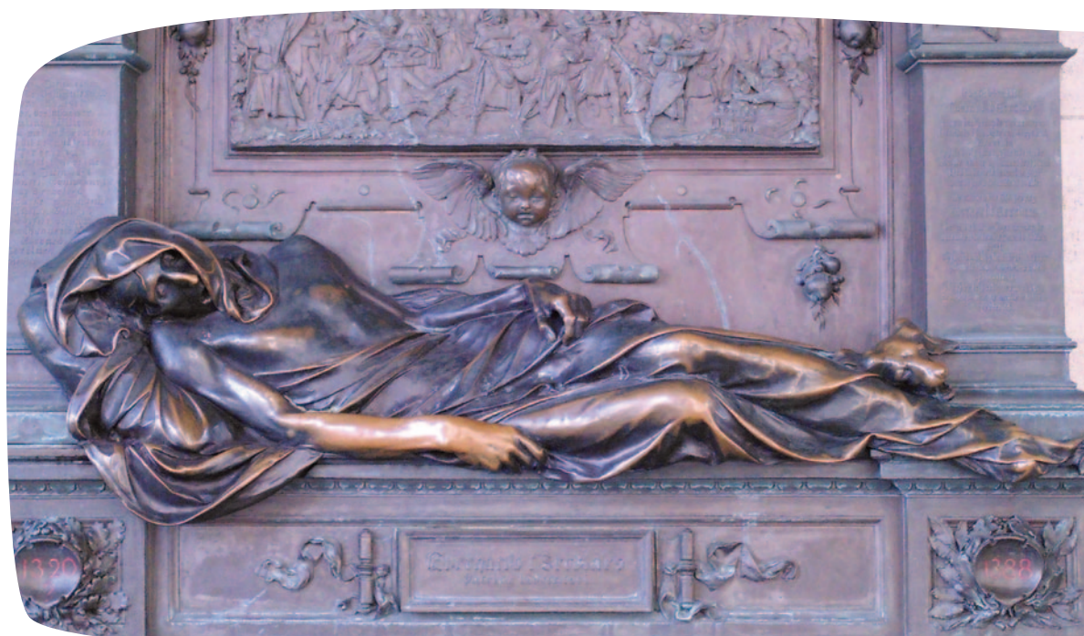
Bronze sculpture discoloration from touch

Patina is thus unique to each material. When feasible, it should be preserved.