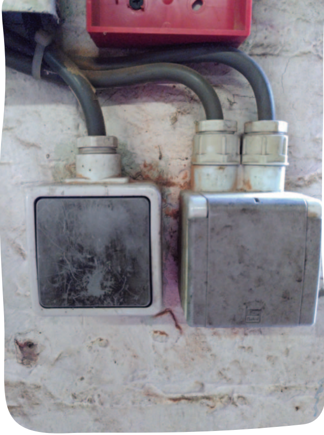
signs of use on a light switch

A surface finish can be both aesthetic and practical of course. Additive surface treatments may depend on the reclaimed material's new use. If a surface is meant to be gripped then a rougher surface is desired. A protective finish may result if the surface will experience higher user traffic than its previous installation. New uses may sometimes require specific characteristics to be met before installation, for example to make a surface easier to clean, more durable, or resistant to certain elements to avoid abrasion.