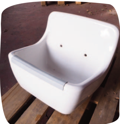
Reclaimed bucket sinks before and after cleaning

Hardware can be the design cornerstone of any room while also going unnoticed. Most commonly made with some kind of metal, hardware can range from legs and feet to hinges, door knobs and handles, and even decorative screws. All of which are in one way or another finished.