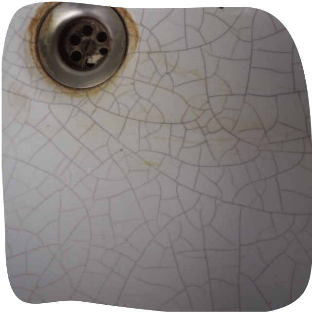
Lime buildup and water damage on a reclaimed and crackled porcelain sink