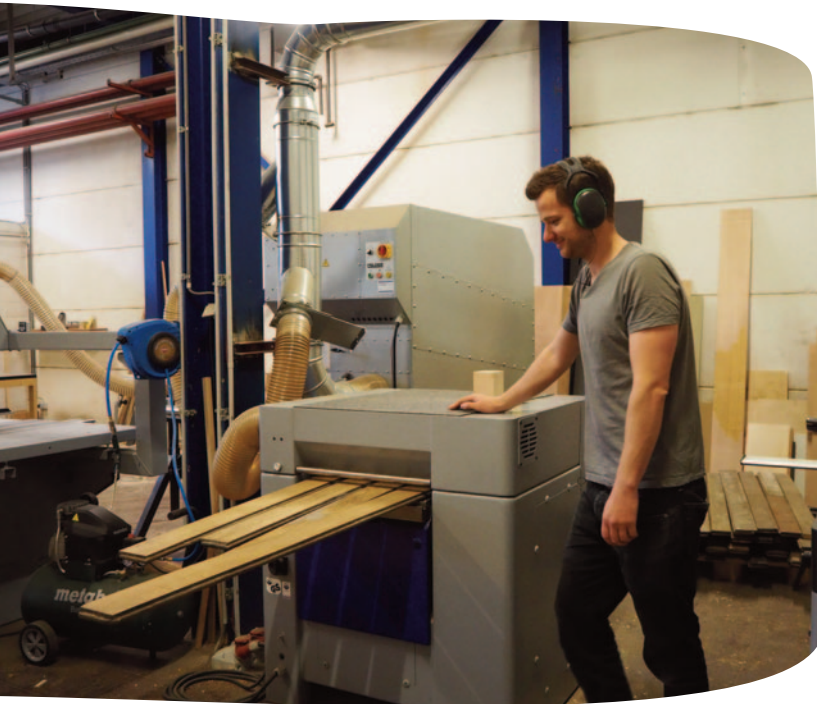
A great example of deformation for reuse is routing old hardwood flooring planks in order to homogenize their widths and for ease of reinstallation. Woodworkers is a workshop in Brussels specialising in furniture ( https://www.woodworkers.be/ ).