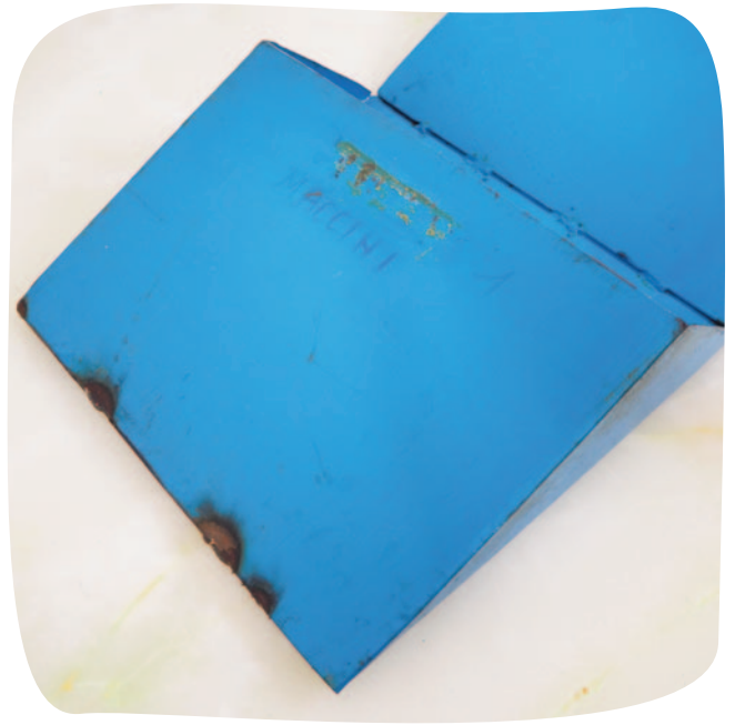
Rust forming where paint is no longer protecting a surface

Many types of patina are a mix between these different phenomena. They are entirely dependent on the material's environment and history. The placement of multiple copies of an identical object in any given space can change each copy's history and aspect through their independent interactions with the environment. In one way or another, these traces are beautiful markings left