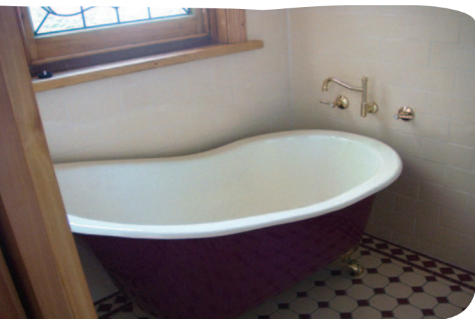
Re enamelled foot bath

Normally, for small surface stains, a simple baking soda and water or vinegar solution and some elbow grease can do the trick. In order to clean the interior surfaces and achieve a like-new functioning toilet or urinal, there must be a more robust procedure. A light acid bath over a period of time dissolves any built up limescale, and after a power wash rinse you are all set. Please mind that such a procedure is more complicated than this simplified description. Some cleaning procedures are not ideal however. As we learn with a large batch of sanitary elements unmounted from a large building in the center of Brussels, this procedure is not economically interesting.