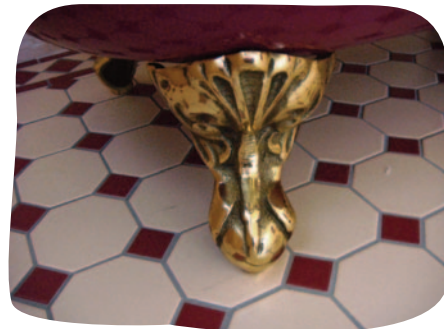
Re enamelled foot bath detail © Marlene Manto