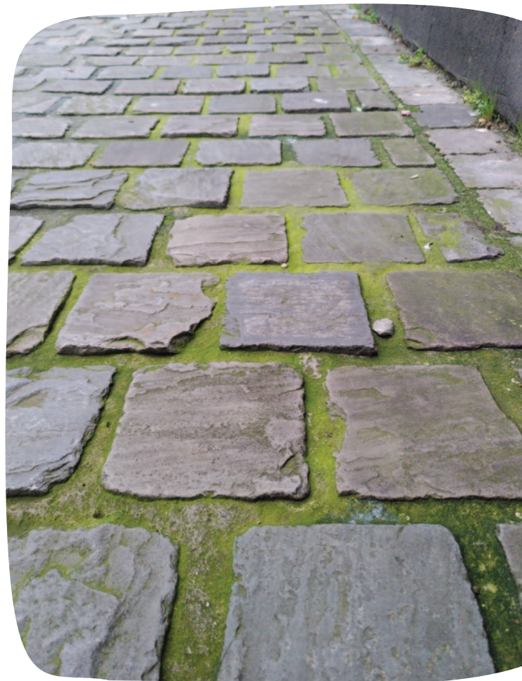
Moss growing in between cobblestones

There are anti-green agents both toxic and less toxic, which may also damage the surface or structure of any given material. There are existing examples of some unprecedented beauty in every city with some form of biological growth. In Brussels we have paved streets, the joints of some streets are vibrant green, giving some areas of the city a surreal glow which can be admired by anyone walking along the streets. It is uncommon to magnify used surface conditions in stone, but why not change this thinking and explore possibilities of embracing a bio-patina?