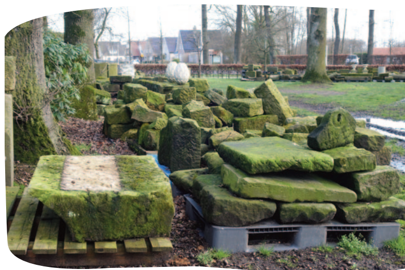
Stone found at the Orimenta yard ( www.orimenta.nl )

For historical preservationists biological growth is unwanted because it may accelerate decomposition or degradation of a stone construction. There are undoubtedly some invasive types of biological growth which embed their roots into the very structure of the stone through crevices, joints, or cavities, accelerating erosion. There is however some due diligence in