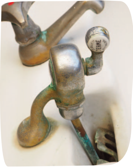
The chrome on these sink accessories has worn off from use, the underlying brass is visible and has gathered some patina as well

Sanitary accessories are most commonly made out of copper, brass, stainless steel, and zinc alloys, a chrome layer can be added for extra protection against corrosion. The insides of these hardware pieces are a combination of metals, and thus the surfaces tend to have equally varying results over time and after use.