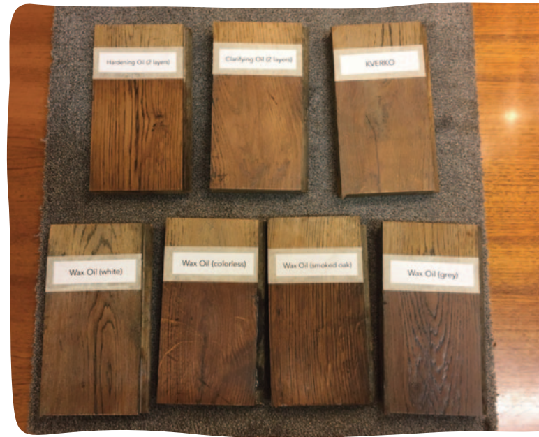
Oil treatment samples

Before any structural transformation is done, cleaning should always be the first choice, and sometimes final treatment a reclaimed material undergoes. This subtractive treatment is simply the gentle removal of dirt, grime or dust by using basic soap and water when possible. Sometimes just water can do the trick. Heavier duty cleaning products may include degreasers at