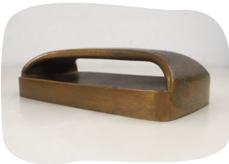
1974 Brass door pull by Jules Wabbes from the Generale de Banque headquarters in Brussels

On a more practical level there are chemical transformations some metals can go through to create a stronger, more resistant object. To prolong life and protect against rust, steel galvanising is a long practiced procedure to give steel a protective coating usually with zinc. The corrosion first occurs on the zinc coating and then starts attacking the main steel structure. This process can be re-done to reinforce steel once more. Chrome has also been used as a protective finish in metal hardware, while even trendier now is the black matte protective finish giving stainless steel accessories (especially in bathrooms) a neutral look to combine with other design aspects.