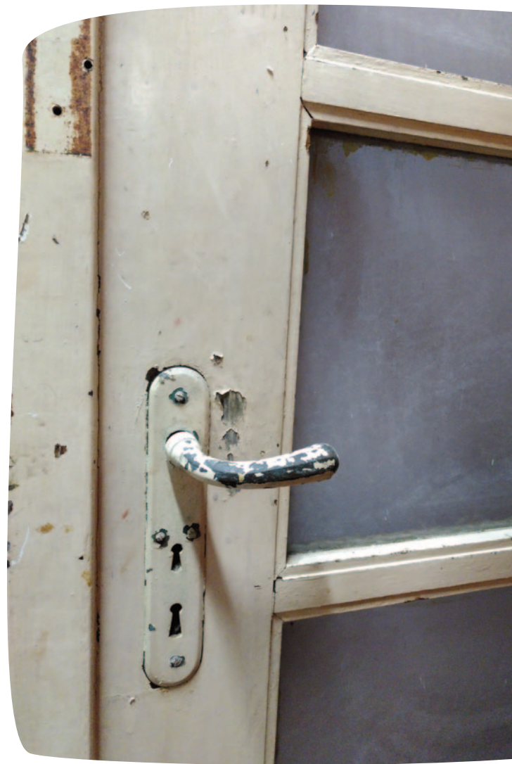
Chipped paint on door and handle

Now that we have the basics covered, let's figure out how to better apply some of these techniques.