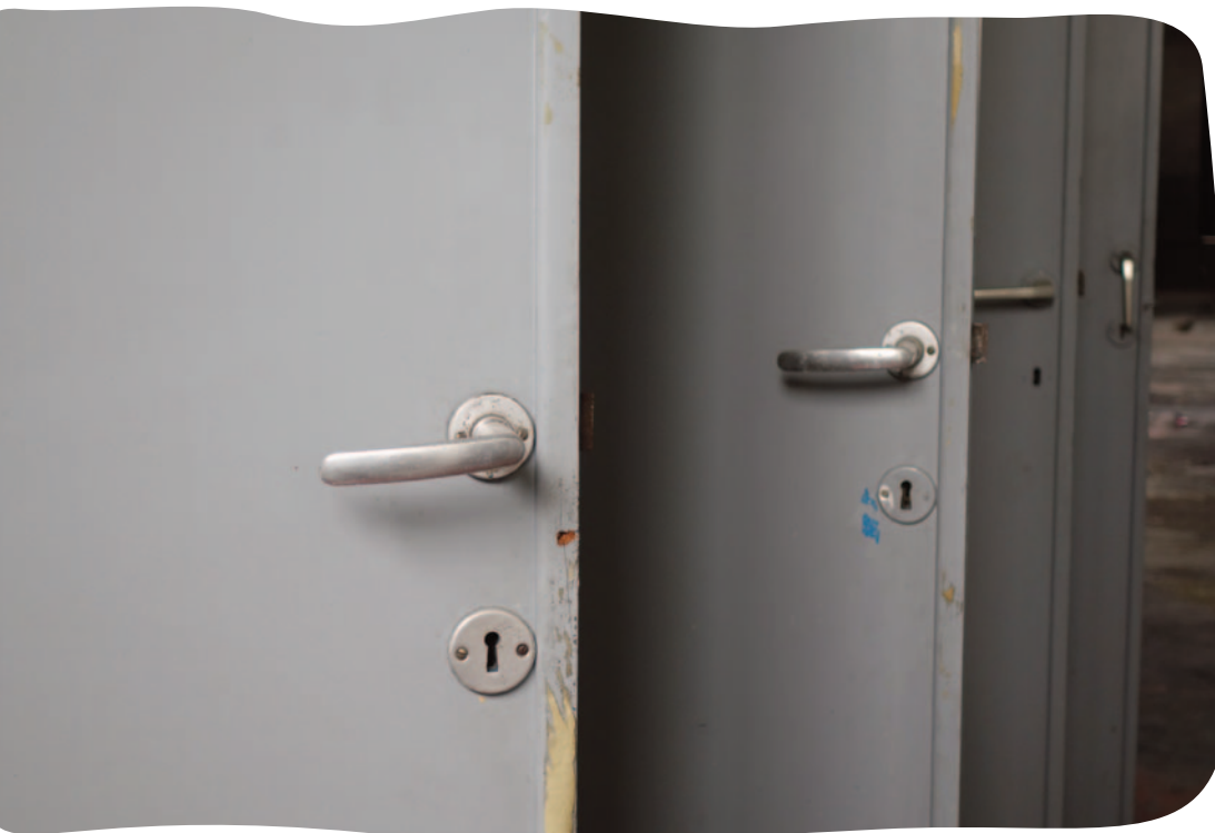
Paint layers on doors chipping away, being painted, and then chipping again, or repainted.