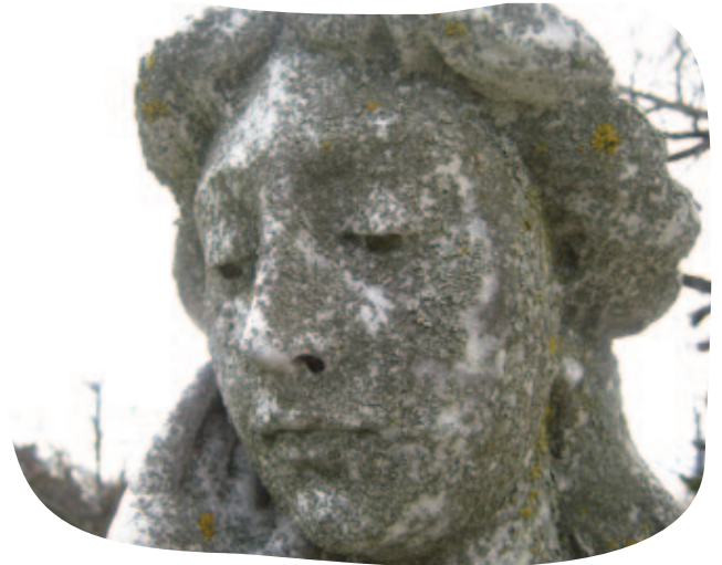
Lichens growing on a stone sculpture in a cemetery.

understanding lichens and other biological growth which may allow for a symbiosis, and protection from, rather than invasion of the elements. There are some studies which support this hypothesis. Results from the comparative analysis of the water transport data on a temple located in Angkor Wat (Cambodia) suggested that lichens had an important moisture-controlling function for the environmentally stressed stones [1]. Lichens are also a good indicator of air quality and can help determine historical timelines of specific sites as they grow roughly 3mm per year.