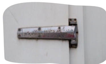
The chrome from this exterior door's hinge has been attacked by the elements

Hardware can be the design cornerstone of any room while also going unnoticed. Most commonly made with some kind of metal, hardware can range from legs and feet to hinges, door knobs and handles, and even decorative screws. All of which are in one way or another finished.